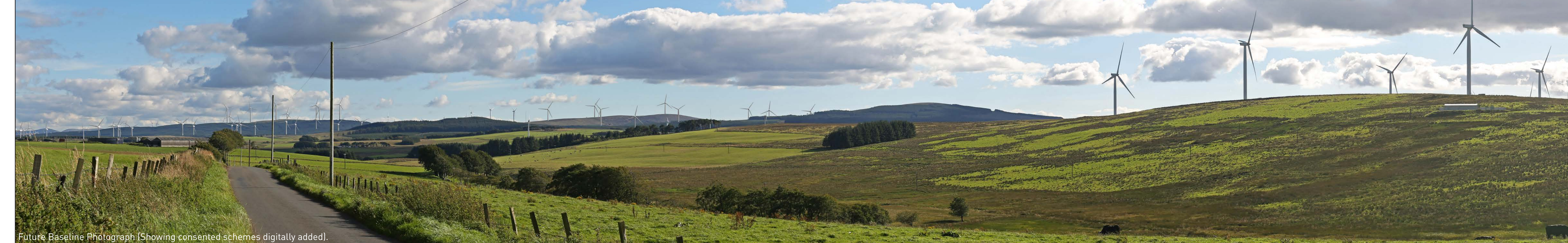
Figure 6.40 (sheet A) Viewpoint 4: Minor road, Brackenridge CUMBERHEAD WEST WIND FARM