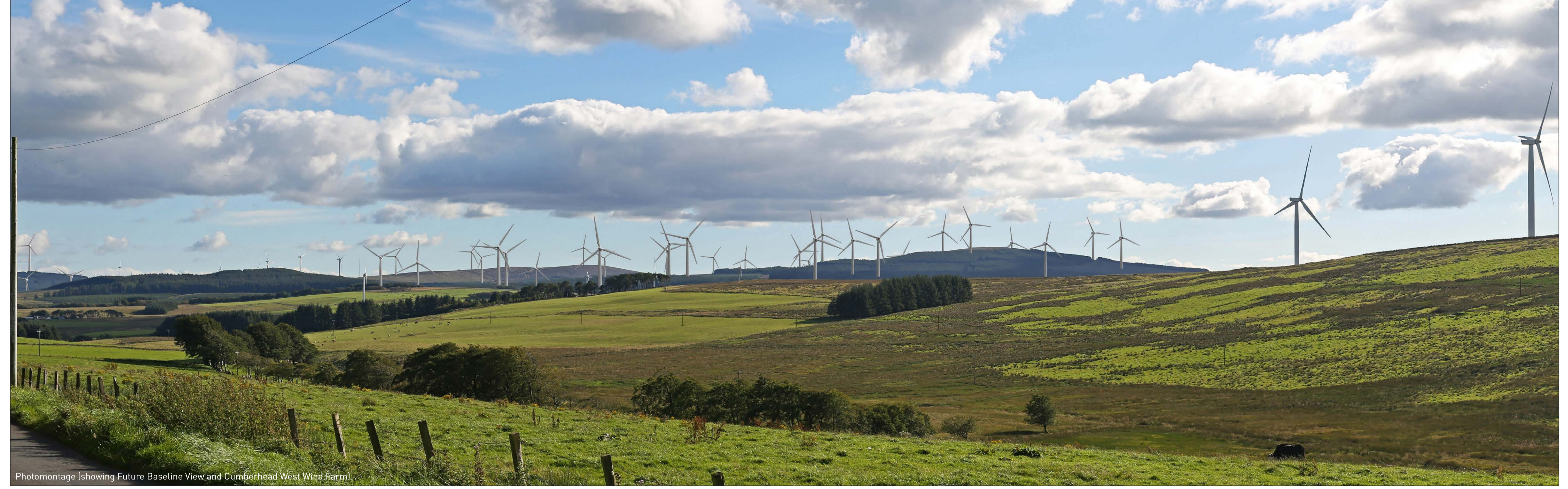
Figure 6.40 (sheet D) Viewpoint 4: Minor road, Brackenridge CUMBERHEAD WEST WIND FARM